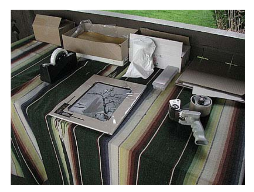
An impromptu outdoor frame shop. We routinely re-frame and re-mat artwork to fit customers' taste. Notice the roll of tape to tape photographs to mats. The boxes contain unmated photographs. Also notice the tape gun to package sold items and the roll of white plastic bags to bag large purchases. These are available at Wal Mart for about $5 a roll.

Essential framing tools include a Fletcher framing staple gun, extra staples, pliers, wire cutter, and screwdriver. With those I can take a photograph out of a frame and re-frame it in a different frame in a matter of minutes. Being able to change frames, and mats, is a service very much appreciated by customers.