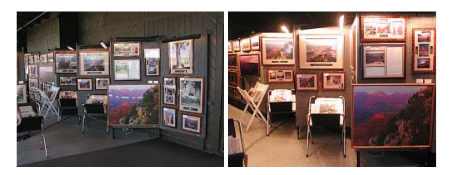
Day and night: Your show should look great night and day hence the importance of good lighting. Below, you can see the same view of the show during daytime, on the left and nighttime, on the right.