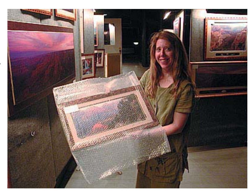
How to wrap a framed piece in bubble wrap.