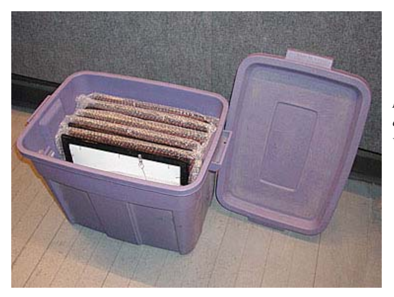
Protecting frames during transportation is essential. We wrap each frame in bubble wrap and store them in plastic containers.

The photographs below show my approach to protecting my work. Again this approach works well for me and I have not had much damage since I started using it. In the beginning I broke a number of pieces and thus had to learn fast! Again, study these photographs as they will teach you more than a lengthy textual explanation.