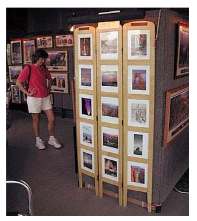
How to display 15 photographs in the least amount of space: use a roomseparation print display! One of my best selling tools.