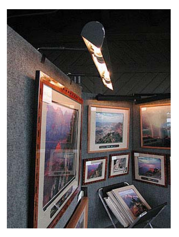
Lighting is important, and should be both elegant and powerful. Those are elegant but not powerful enough. They were mandated by the National Park Service