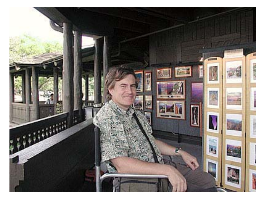
Once the show is set up all you have to do is kick back and wait for the customers