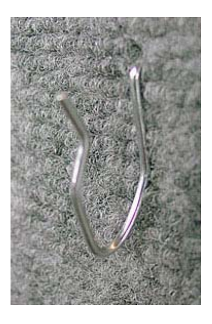
The best way to hang artwork on carpet-covered displays is with curtain hooks